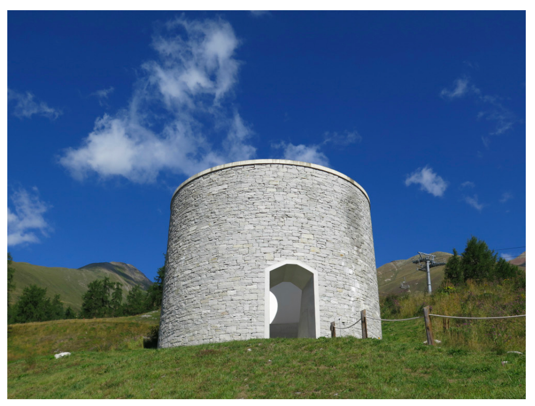
James Turrell Skyspace Piz Utèr Hotel Castell Zuoz(2005).