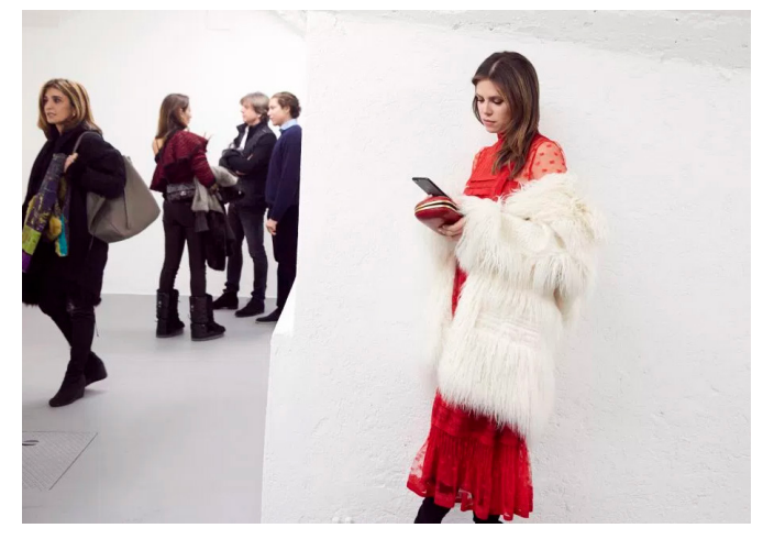
Dasha Zhukova at the opening celebration for "Age of Ambiguity."