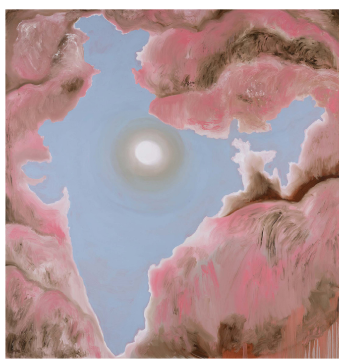
Francesco Clemente, India IV , 2019, oil on canvas, 96 x 92 inches (243.8 x 233.7 cm); © Francesco Clemente; Courtesy the artist and Vito Schnabel Projects

Clemente plays with the contrast between New York, where he lives and works, and Chennai, formerly known as Madras, the capital of the Indian state of Tamil Nadu.