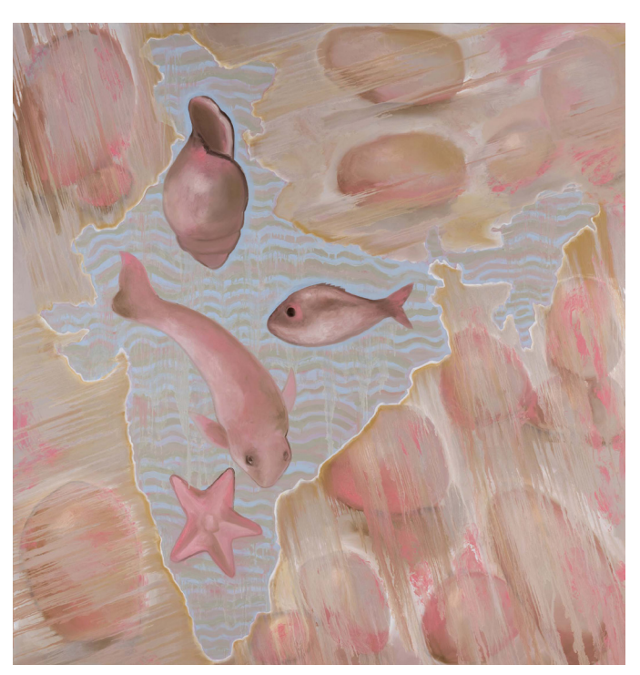
Francesco Clemente, India III , 2019, oil on canvas, 96 x 92 inches (243.8 x 233.7 cm); © Francesco Clemente; Courtesy the artist and Vito Schnabel Projects

Clemente is regarded as a key figure in the Italian Transavanguardia movement of the 1980s, rejecting Formalism and conceptual art in favor of a return to figurative art and Symbolism, and a leader of Neo-Expressionism in the United States. His work gained global attention in the 39th edition of Venice Biennale in 1980.