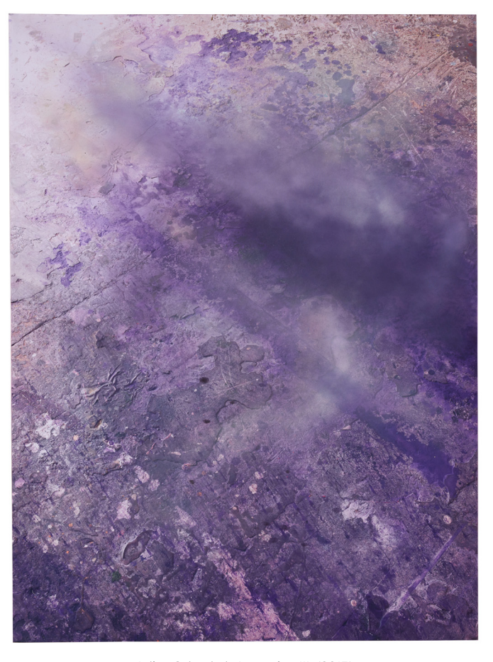
Julian Schnabel, Ascension III, (2015)

influence, and his belief that art and beauty will save the day.