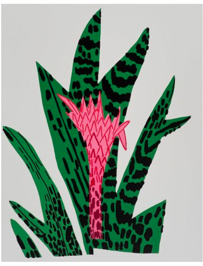
Jonas Wood, Clipping J2, 2015 , Oil and acrylic on canvas. 88 x 69 in(223.52 x 175.26 cm).