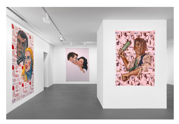
Installation view, Walter Robinson, The Americans, Vito Schnabel Gallery, St. Moritz, 2017