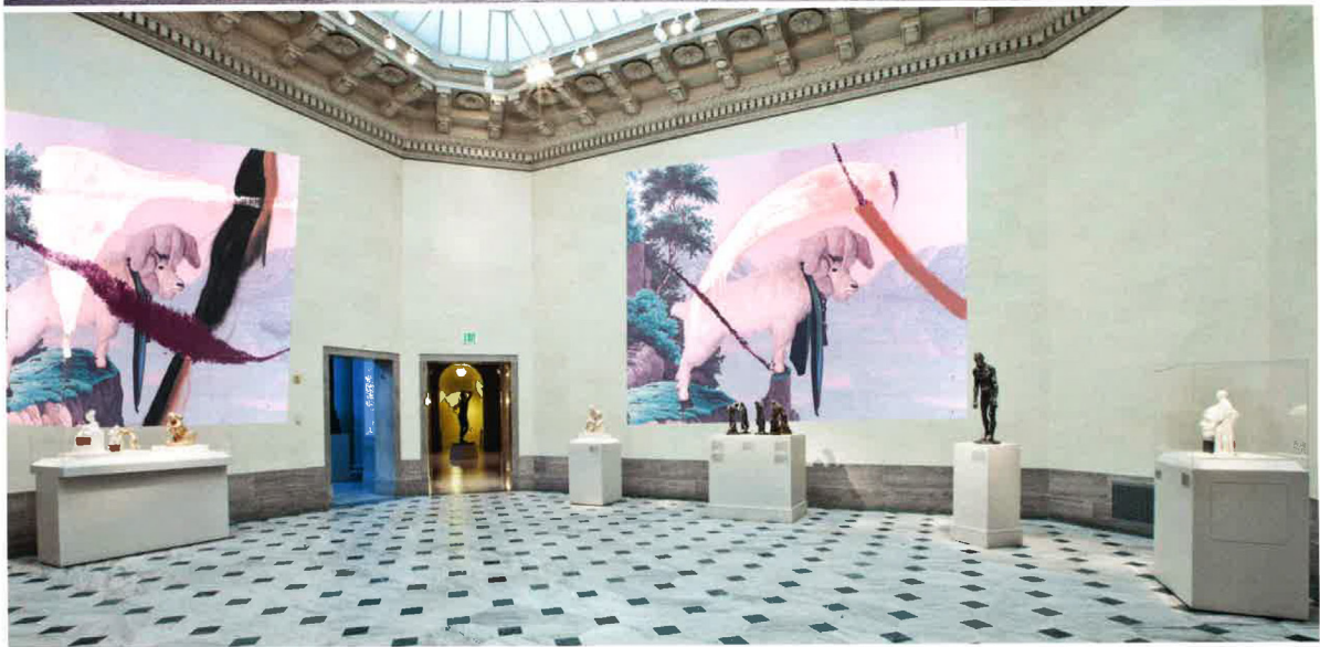
Top and bottom: Installation proposal of Julian Schnabel— Symbols of Actual Life /Legion of Honor, San Francisco