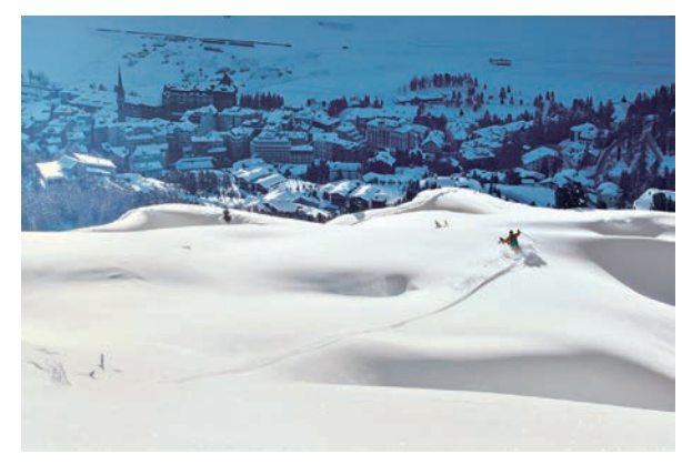
Skiing has lured adventurous travelers to the glamorous alpine village of Saint Moritz since the mid-19th century.