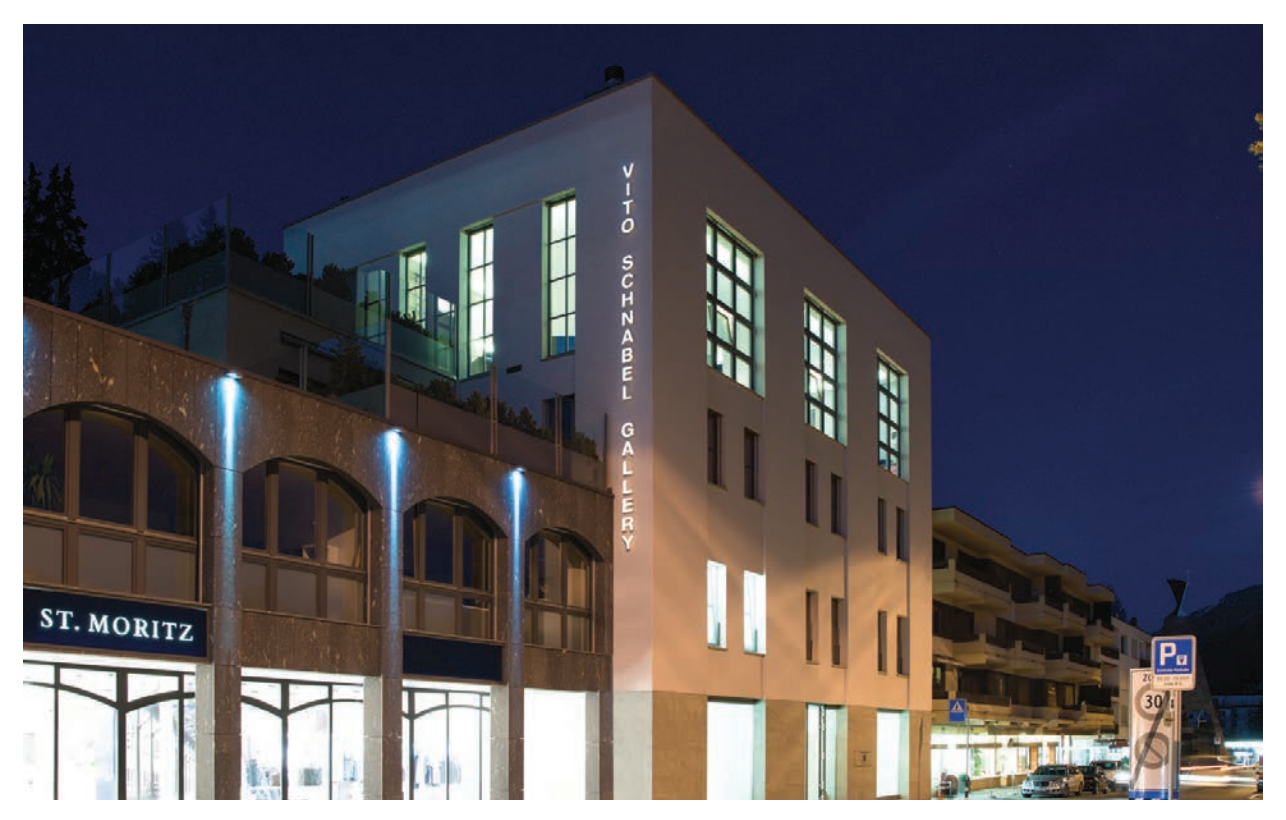
Vito Schnabel's gallery occupies the space that formerly housed Bruno Bischofberger's.

New galleries, a soon-to-open museum, and the return of a unique art fair add to the Swiss city's cultural cachet