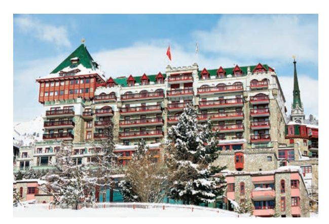
Badrutt's Palace Hotel is a gathering spot for Saint Moritz's most fashionable crowd.