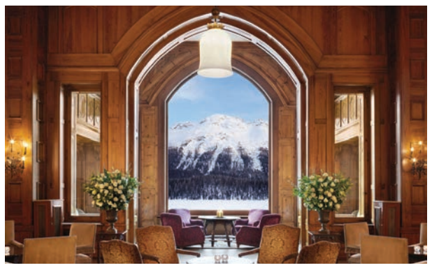
Badrutt's Palace Hotel Le Grand Hall.

To the uninformed who thought Saint Moritz was all about skiing, ice cricket, dogsledding, and polo, this burgeoning art scene is a welcome surprise. "There is a growing ecosystem of artists, galleries, and events in the Engadine