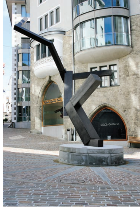
Joel Shapiro's Untitled sculpture has pride of place outside Galerie Karsten Greve.

A version of this article first appeared in print in our 2018 Winter Issue under the headline Art in the Alps. Subscribe to the magazine.