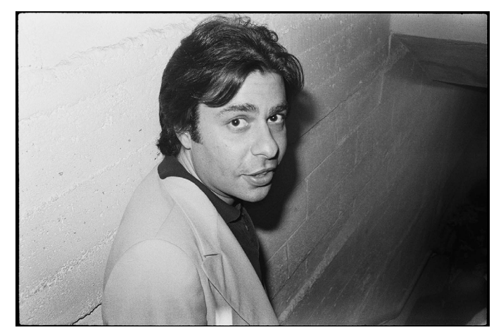
'Self Portrait, New York,' 1976