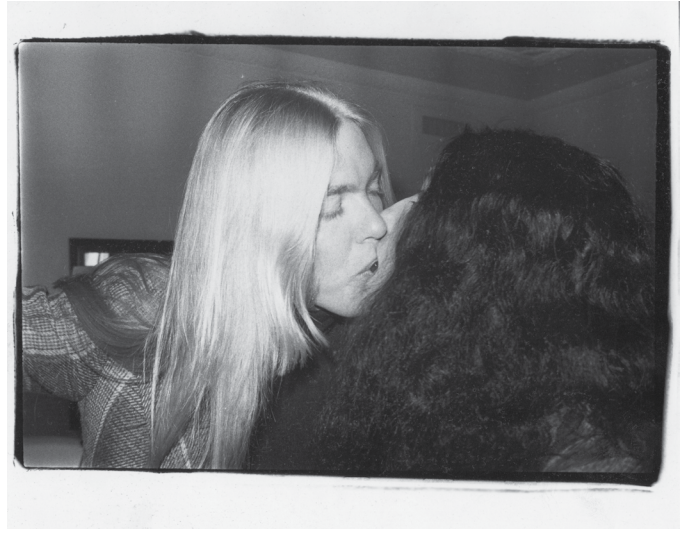
'Gregg Allman and Cher, Carter Inauguration White House Reception,' 1977