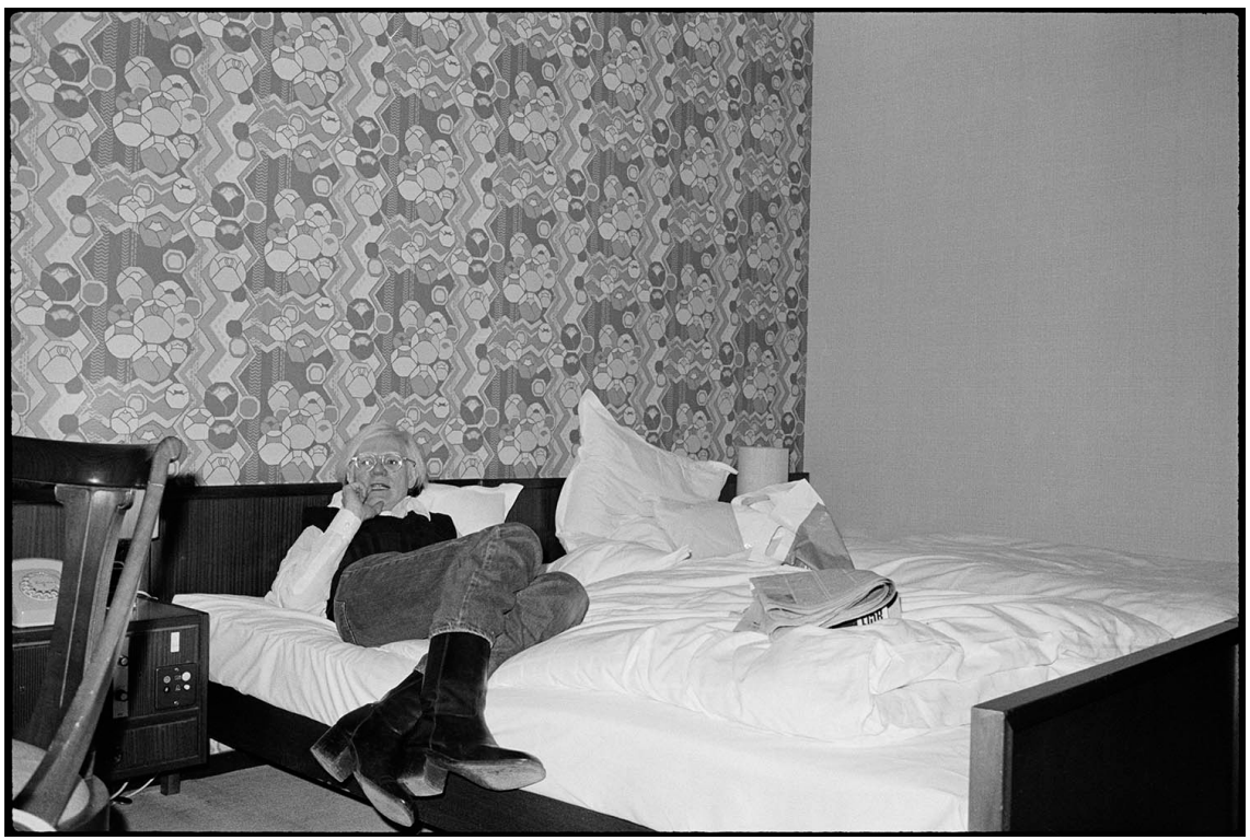
'Andy at the Hotel Bristol, Bonn,' 1976

The New York-based Vito Schnabel Projects will showcase 150 vintage prints in an upcoming exhibition, Pictures From Another Time: Photographs by Bob Colacello, 1976 - 82, presenting images taken during the time that Colacello served as editor of Andy Warhol's Interview magazine. In addition to his role as editor, Colacello also joined Warhol on a number of European excursions, allowing him to capture rare moments in the artist's life.